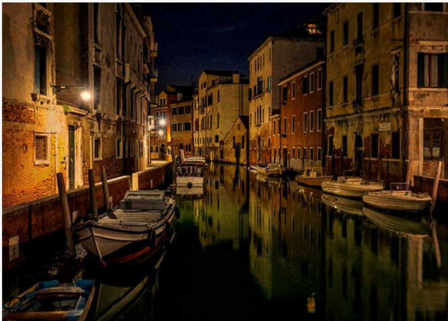
Gr E-Award, Night_and_Silence_in_Venice~Ojars~Kratins, Rossmoor Photography Club