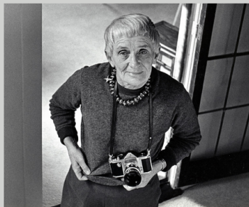
Dorothea Lange with her camera.

Explore, through her granddaughter's eyes, the life story of Dorothea Lange, the photographer who captured the iconic image "Migrant Mother." Never-seen-before photos, film footage, interviews, family memories, and journals reveal the artist who challenged America to know itself.